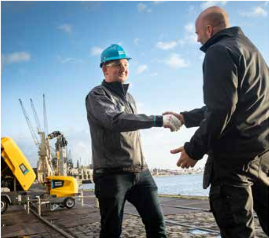
Atlas Copco ensures maximum uptime of your equipment. With the cold weather option, the compressor service interval of the X-AIR 185-100 increases from 1000 hours to 1500 hours or 2 years.

Service is a crucial part of the lifetime of a compressor. With service, you can guarantee the uptime of your compressor, while protecting your investment. On the other hand, service should take as little time as possible, so you maximize your uptime.