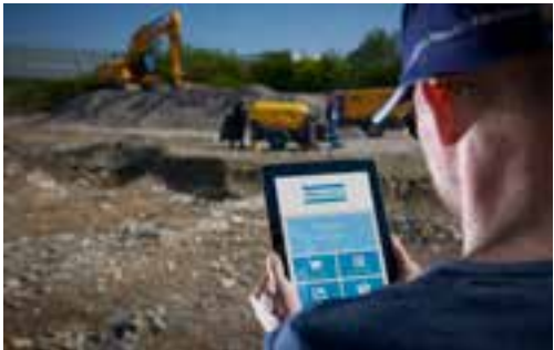
Through power connect app, quick access to view and order the relevant spare parts.